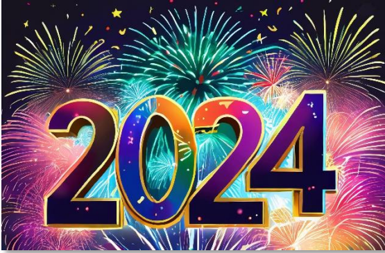
AI generated image using Adobe Firefly

I wish you a whole new year of wonderful Photogenealogy discoveries.